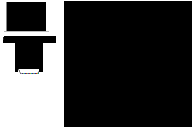
Drain Plug Washer with Rubber Perimeter

[REDACTED] accept 1 quart of oil for topping up.